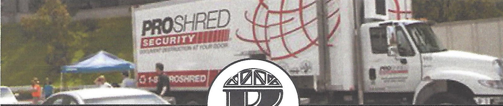
Shredding by Pro-Shred